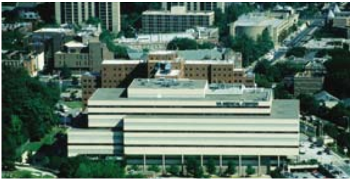
Philadelphia VA Medical Center

VA planners expect about 400 troops at each medical center, where they will work with health care providers to identify potential health issues – and treat known health problems before they affect a person’s future deployment status or career. According to DOD officials, many deployment-related health problems may not arise until three to six months after someone returns from deployment.