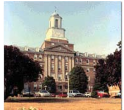
Coatesville VA Medical Center